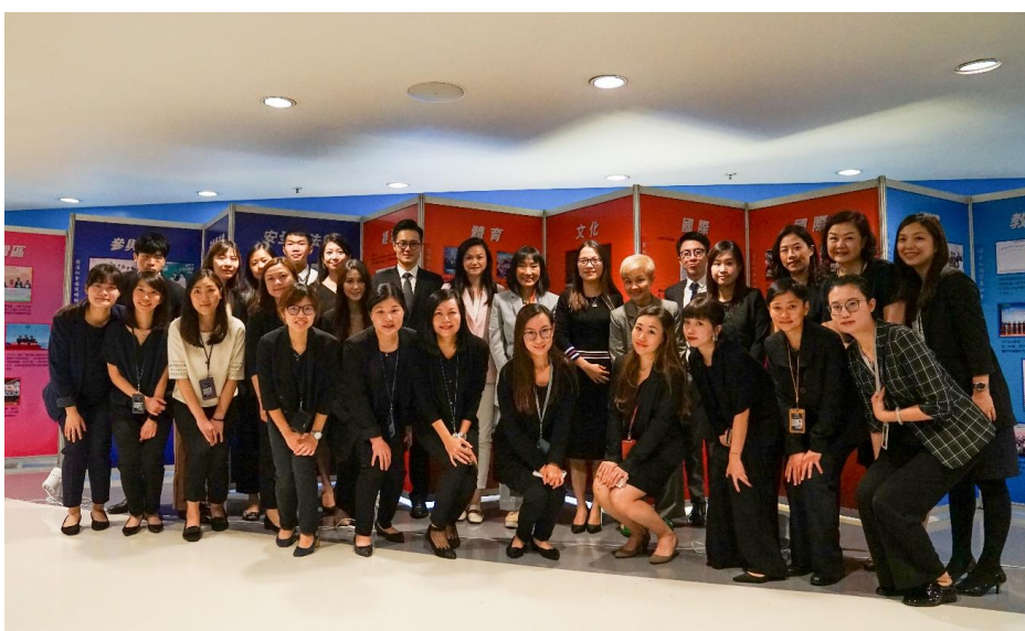
Women's General Association of Macau representatives, Melco management team and Melco employees pose for a group photo.